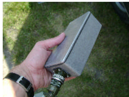
Light weight power supply