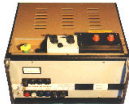
Remote Control Unit RCU